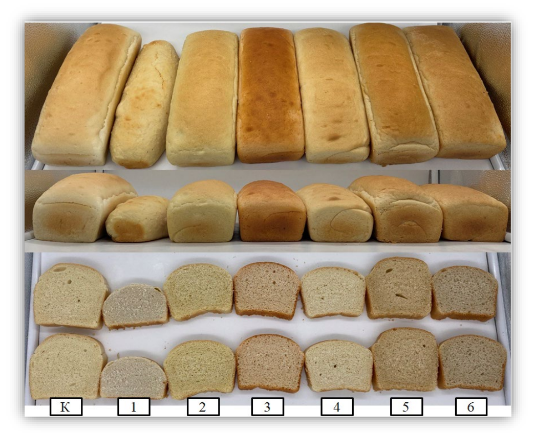
Figure 2. Baked bread samples made with 25% addition of: coconut flour (1), corn flour (2), lentil flour (3), brown rice flour (4), amaranth flour (5), and hydrothermally unprocessed buckwheat flour (6) compared to the reference sample (K)